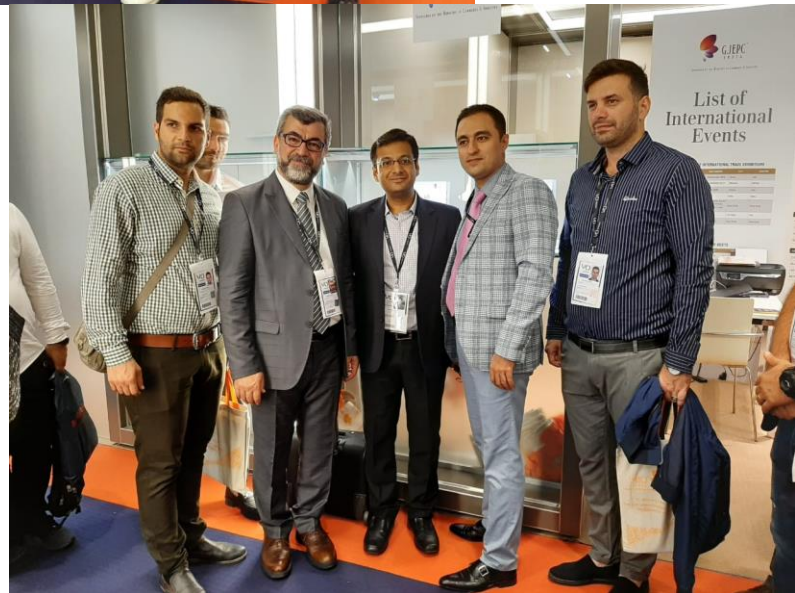
A delegation from Iran visiting India Pavilion