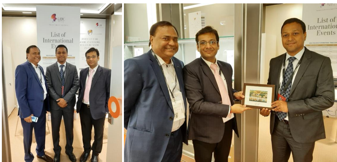
Consul General of India, Milan, Italy at GJEPC India pavilion

H.E. Dr Binoy George, Consul General of India, Milan, Italy visited the show on 9 th October 2019. The Consul General visited the India Pavillion and met Indian exhibitors to understand their expectations & their fulfilment from the market and the show.